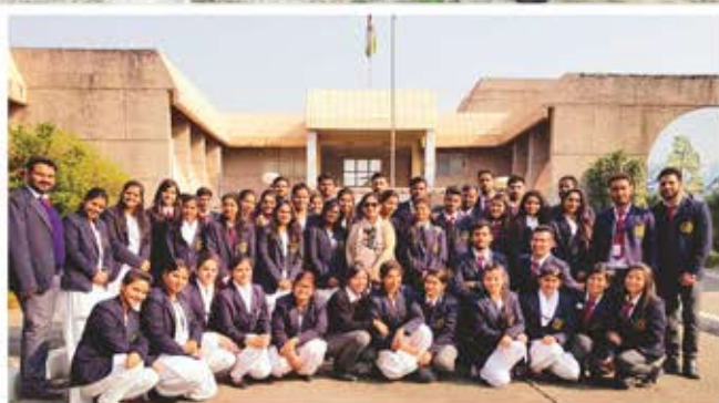
Visit to Wadia Institute of Himalayan Geology, Dehradun