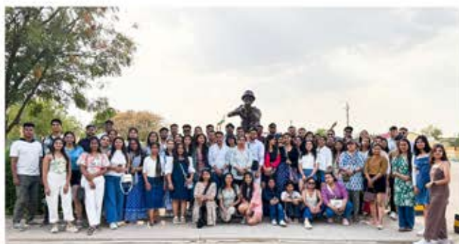
Education Tour to Jaipur, Rajasthan