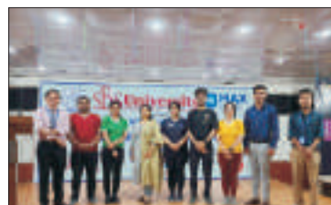
Workshop on "Basic Life Support" in association with Max Healthcare